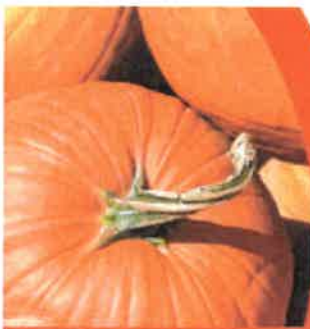
Plate it up!

Nutritional Analysis: 220 calories, 13 g fat, 2 g saturated fat, 30 mg cholesterol, 270 mg sodium, 26 g carbohydrate, 1 g fiber, 14 g sugars, 4 g protein.